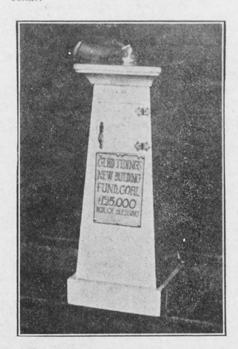
The Box of Blessing

No man on earth can beat God giving. The man who tithes and gives God a regular offering only builds a chute for God to shovel a full supply into his cellar.