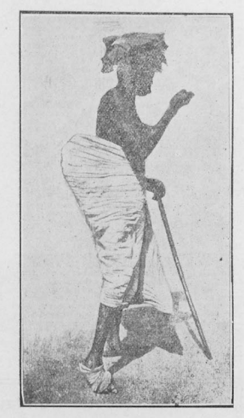
"The Old Lady of the Ditch," Carrying Her Chop Home on Her Back.