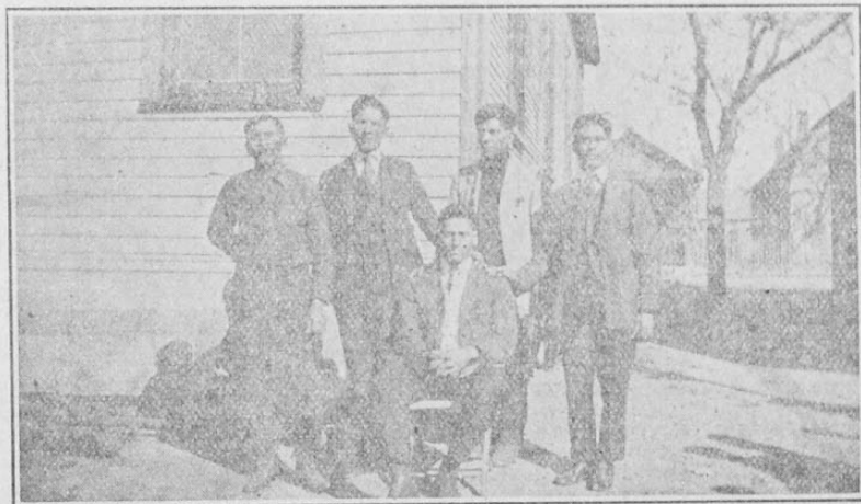
Mexican Workers Licensed and Ordained at the Recent Mexican Convention at Dallas, Texas.

Let us pray much for the Mexican work. God is doing a great work among these people and the possibilities are tremendous for a multitude to be gathered into the fold.