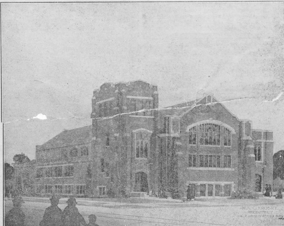
NEW PENTECOSTAL CHURCH FOR DETROIT.

"Full of really practical help for every lesson, with suggestions for its adaption to every grade." Cloth bound, post paid. ....$2.10