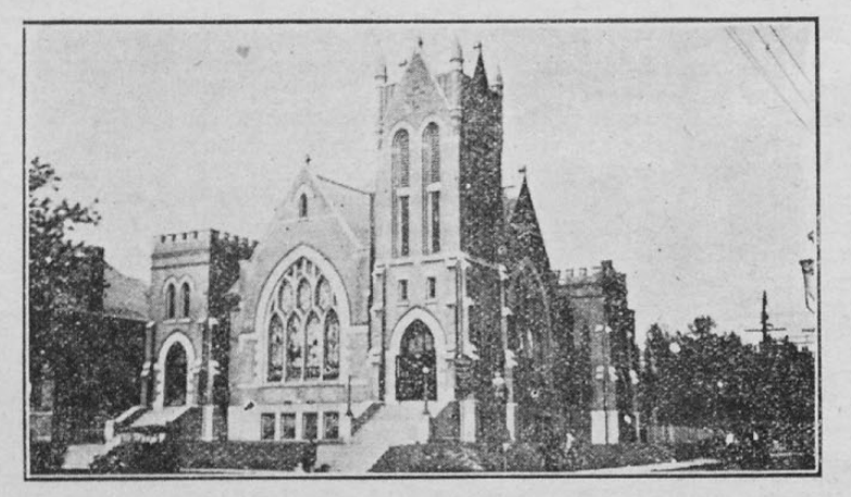
The Salem Church at St. Louis, where the General Council was held. The Pentecostal people of St. Louis have decided to purchase this building.

This truth is beautifully brought out in the message concerning the Vine and the branches. "I am the Vine, and ye