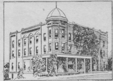
MID-WEST BIBLE SCHOOL.