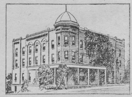
MID-WEST BIBLE SCHOOL Auburn, Neb.

Recently I have had two very marked cases of the manifestation of the keeping cases of the manifestation of the keeping power of God. One was when I came within a few feet of a very large snake which spit all over my face. This is said to be very painful causing much swelling. I immediately looked to the Lord and I had neither pain nor swelling. This happened on Sunday and the following Tuesday I met with what would have been a very painful accident had it not been for the power of God. Through play my dog tore the flesh from one of my fingers, leaving the bone bare. I never had one throb of pain in it from the time of the accident until it was completely healed only one week later! I never lost the use of my hand for one hour. This is the greatest miracle of healing I have had in my life. I have had wonderful deliverances from I have had wonderful deliverances from pain; but to have the flesh torn from the bone and never a dart of pain nor a bit of soreness, was a real miracle. I asked the Lord for a miraculous healing of the