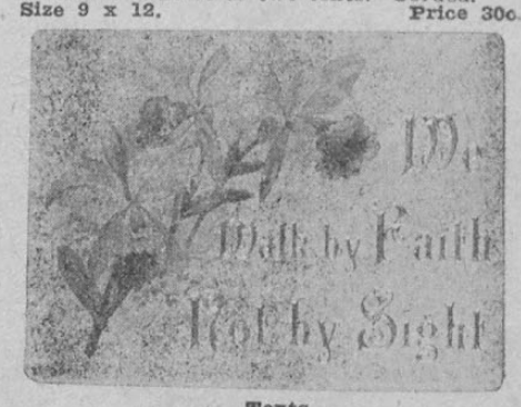
4445-O Lord I will walk in Thy Trutk 4446-We walk by faith, not by sight.

CHRISTIAN WALK SERIES. Orchids on white back-ground, lettering in silver. Choice of two texts. Corded. Size 9 x 12. Price 30c.