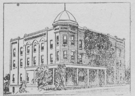
NEW BIBLE SCHOOL, Auburn, Nebraska.

Other denominations are laying millions on the altar for their schools, missions, etc. Some of these teach Higher Criticism and tear the blessed Book to pieces. It will be a shame and a disgrace before God, on our brethren who see and know the truth and who can give for God and His glory, if they don't give liberally to uphold the true Word of God and to help get our young people settled in God and in the truth. A number can give $1,000 each, more can give $500 each, still more can give $100 each. I believe they will see the hand of God in this for which we have prayed for years, that they will hear the call of heaven herein, and will give joyfully at once to God's glory. Reader, ask God about it.