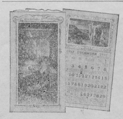
1917 Calendars. To close out, 10c postpaid. Write for prices on 1918 Calendars

Postpaid $1.15 (Great Britain, 4s. 9d.). Order now from The Gospel Publishing House, 2838 Easton Ave., St. Louis, Mo.