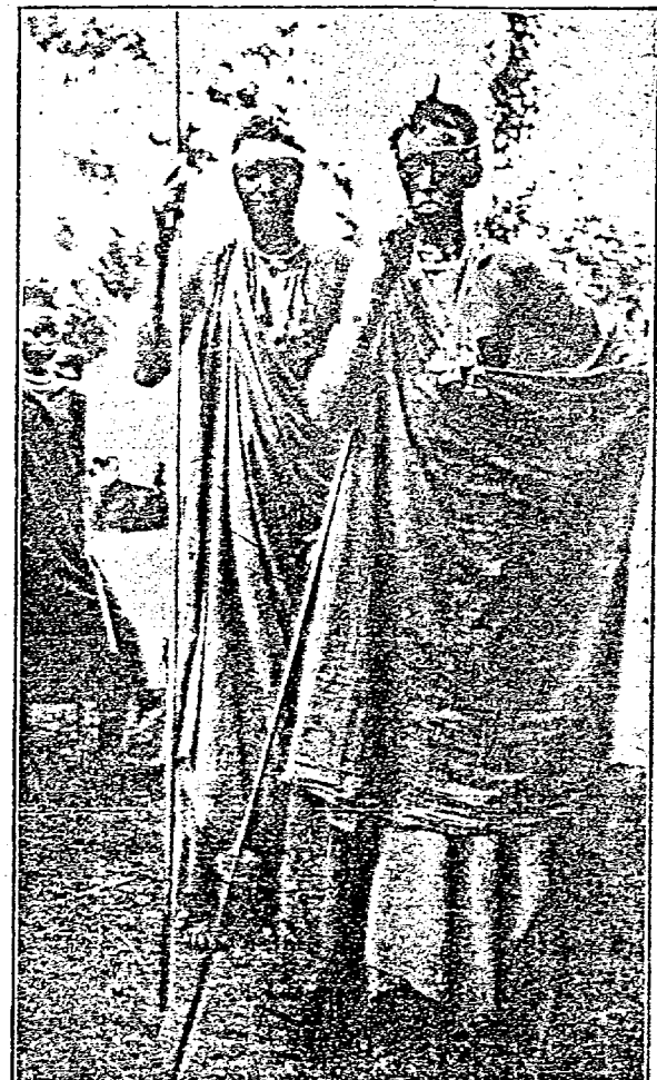
CATTLE PEOPLE OF RUANDA.

I then made my way to a place called Mwezi, from whence I should leave the main road, and go inland by a footpath. After a little refresh-