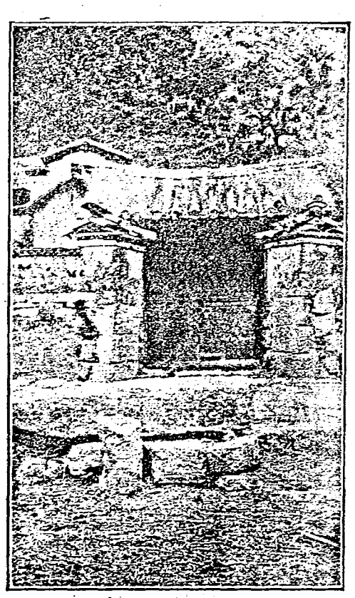
A WAYSIDE SHRINE.

had finished travelling and were really at our journey's end, after being over seven weeks on the way. How strange everything seemed! Streets, people, "shops," modes of transit—everything! We had begrudged the enormous amounts charged on the railway for passenger fares and for freightage on our goods, but as we reflect on the tremandous, hazardous, and expensive project to provide such a railway, the keenness of the disappointment of parting with so much money is somewhat abated. But a few days ago, in the station, a Chinese evangelist said, with real gratitude, "What a boon is this railway, enabling the missionaries to get here so many, many weeks more quickly than by the old 'road' method!" Oh, the need of thousands more