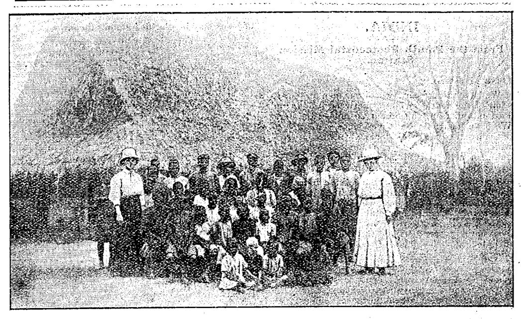
A PENTECOSTAL MISSION IN LIBERIA. (Page 164.)