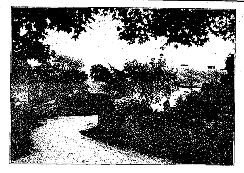
VILLAGE OF LLANDEGLY, RADNORSHIRE. Revival Meeting held near this place. (See page 49.)